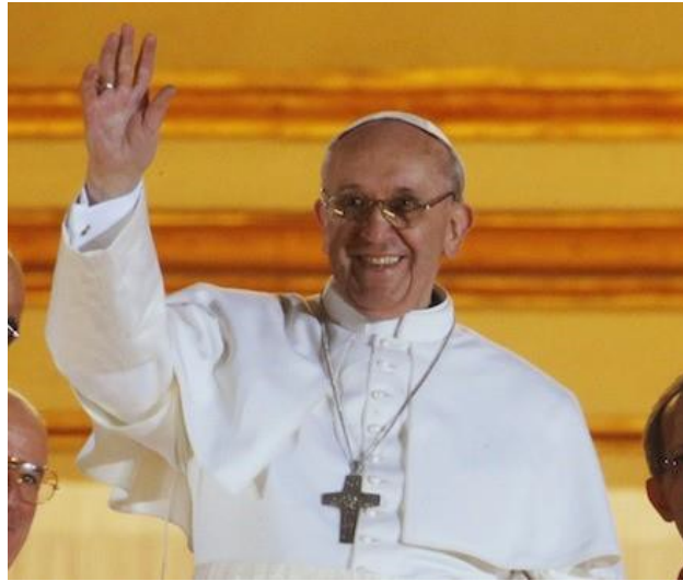
Our Holy Father, Pope Francis I